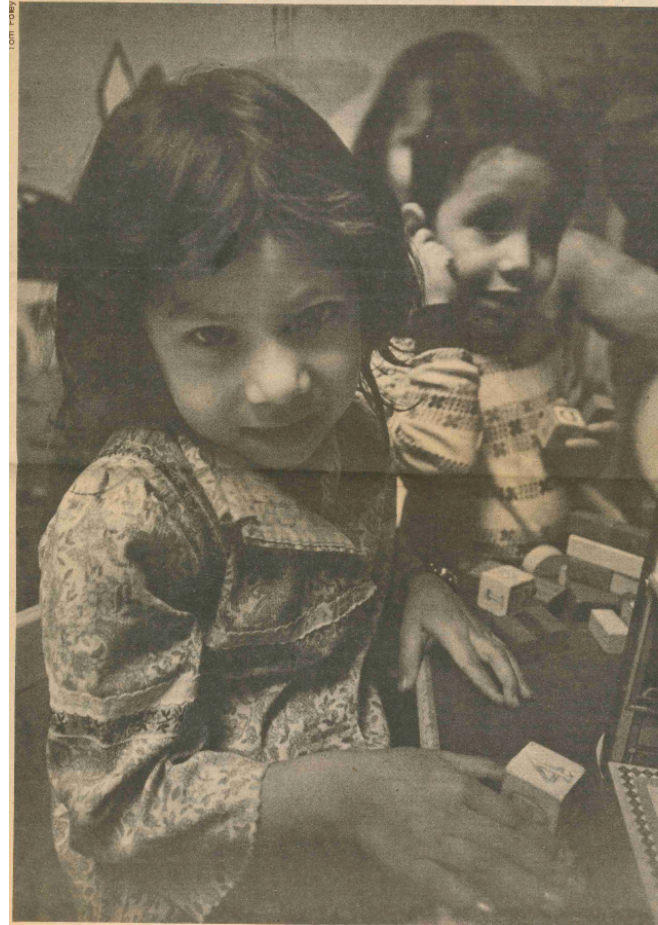
A coterie of customers in CUHCC's playroom